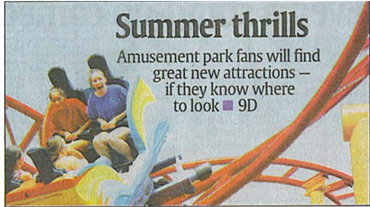
In K.C.: Worlds of Fun's Spinning Dragons takes nerves, strong stomach.