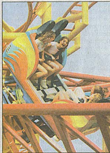
Worlds of Fun

Information: 816-454-4545; worldsoffun.com